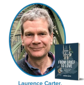
author of From Grief to Love: Walking Around England and Wales

The 1818 Society Book Repository is not just for retirees—current staff also have full access to the online collection and are encouraged to browse, read, and celebrate the continued contributions of the WBG alumni community. Whether you're planning your next vacation and looking for a good read, or curious to explore the passions and reflections of former colleagues, the Book Repository is an inspiring and accessible resource.